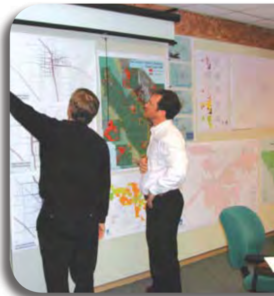
Figure 1: Ranking of approaches to issues in Kern County’s future.*

In May 2007, Kern COG also collaborated with Vision 2020, the City of Bakersfield, and the County of Kern on a series of four public workshops as part of the process to update the Metropolitan Bakersfield General Plan. The General Plan addresses similar questions to the Blueprint Program about growth that is expected in the Bakersfield area. In those meetings, participants identified the following priorities for their communities: